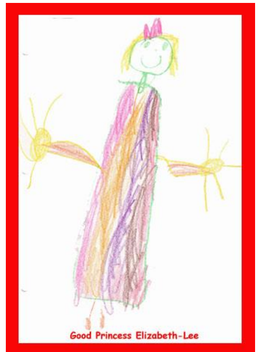
Good Princess Elizabeth-Lee

Princess Elizabeth-Lee was 15 years old, an age in those days when a good princess should be getting married. The good princess had no shortage of suitors, for she was, without question, the fairest and most lovely girl in all of the Five Kingdoms. She was courted by princes and nobles from throughout the land, but none struck her fancy as a Princess' fancy should be struck. She longed for adventure, but adventure was always scarce in Gillihad.